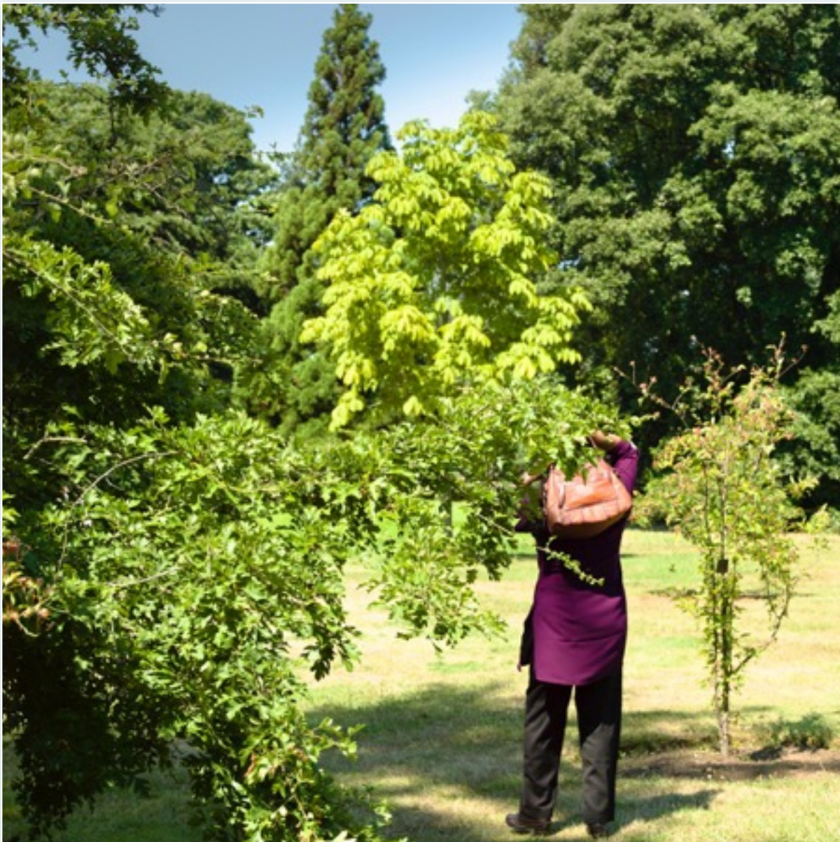
Project GARDEN. On-going